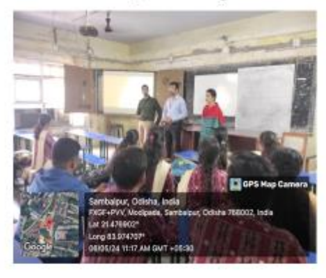
Aparna Motors, Sundergarh