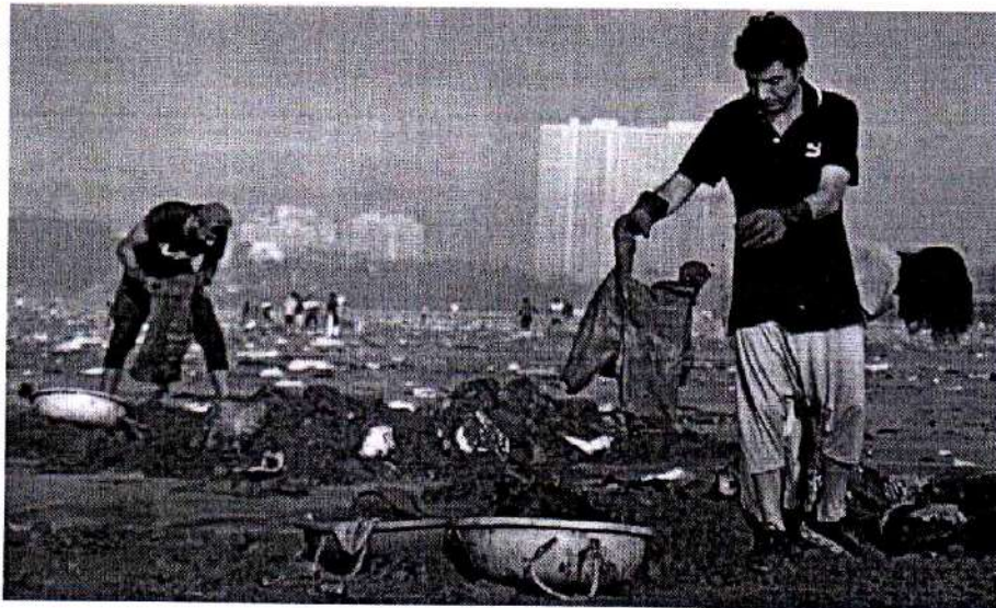
Cleaning a beach