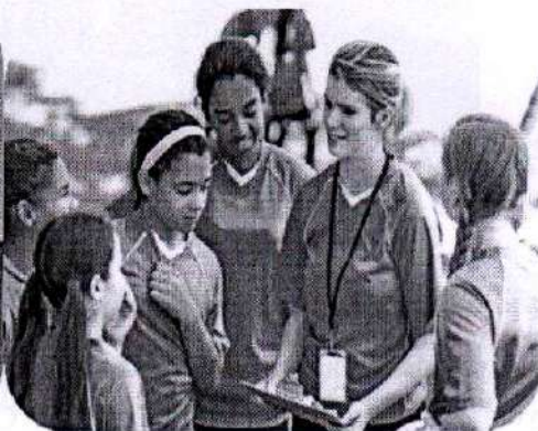
Helping local sports groups