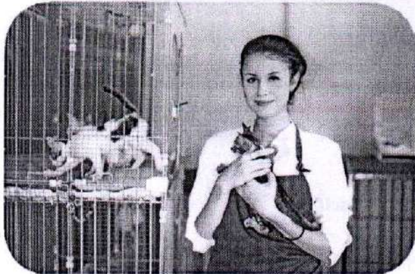
Helping injured and homeless animals