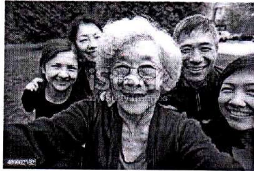
Age Well Foundation