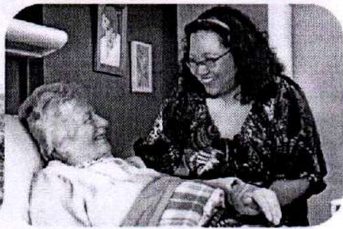
Serving food to people in need