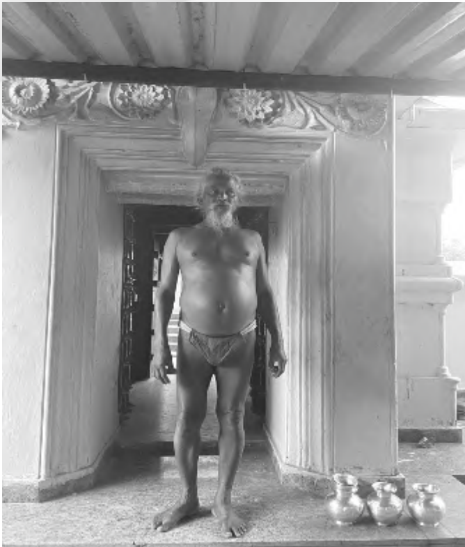
Ashram Bartunda (Kashipali, Bargarh)