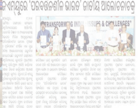
ଜାତୀୟ ସମ୍ମାନ 'ପରିବର୍ତ୍ତନଶୀଳ ଭାରତ' ଜାତୀୟ ଆଲୋଚନାତନ୍ତ୍ର