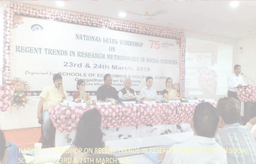
NATIONAL WORKSHOP ON REGENT TRENDS IN RESEARCH METHODOLOGY IN SOCIAL SCIENCES ON 23RD & 24TH MARCH