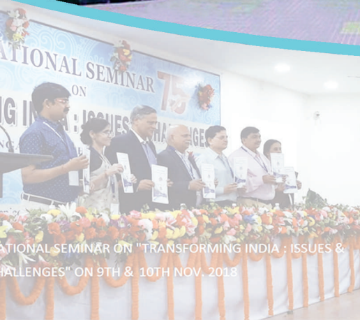
NATIONAL SEMINAR ON "TRANSFORMING INDIA : ISSUES & CHALLENGES" ON 9TH & 10TH NOV. 2018