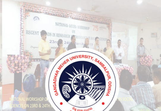
NATIONAL WORKSHOP ON REGENT TRENDS IN RESEARCH METHODOLOGY IN SOCIAL SCIENCES ON 23RD & 24TH MARCH