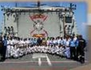
Group photo of NCC cadets